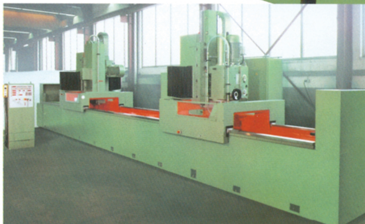
6 Combined production machine with milling and grinding carriage. CNC controlled, 6 axes