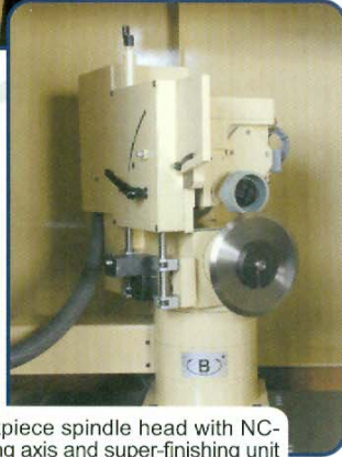
Workpiece spindle head with NC-rotating axis and super-finishing unit