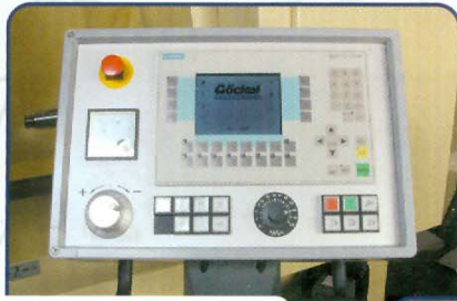
NC-operator-panel-control with automatic operator guidance