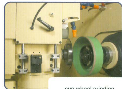
cup wheel grinding

Roughing and finishing in one operation. Using two wheels mounted on one arbor. Automatic deburring and polishing of top knives with the super-finishing unit.